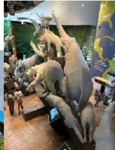
BioMuseo, Amador Causeway

September 30: Canopy Tower, Gatun Lake Boat Ride, Summit Gardens