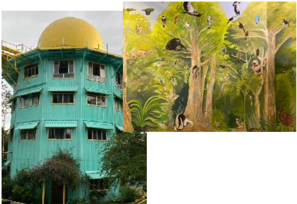
Canopy Tower

A whopping 17 participants arrived at the Canopy Tower, eager to learn everything they could about the biodiversity of the region. Our two scientists and local Canopy guides quickly made everyone feel welcomed.