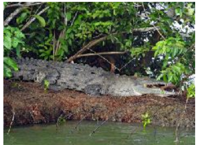
The boat ride on Gatun Lake typically yields White-faced Capuchin Monkeys and American Crocodiles. Note that sex determination in crocodiles is determined by the temperature of the incubating eggs.