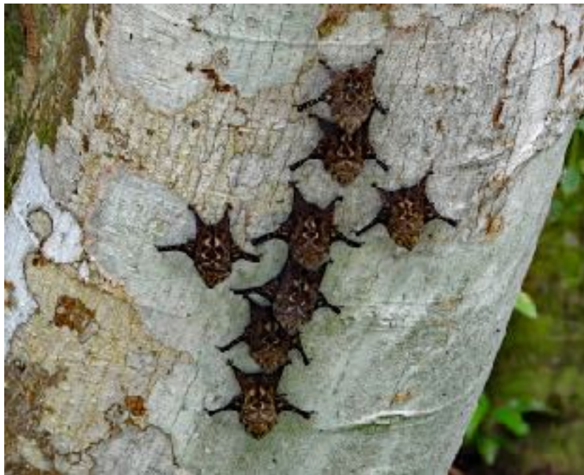
Nocturnal Proboscis Bats have the Unusual habit of Sleeping in a Line on Tree Trunks