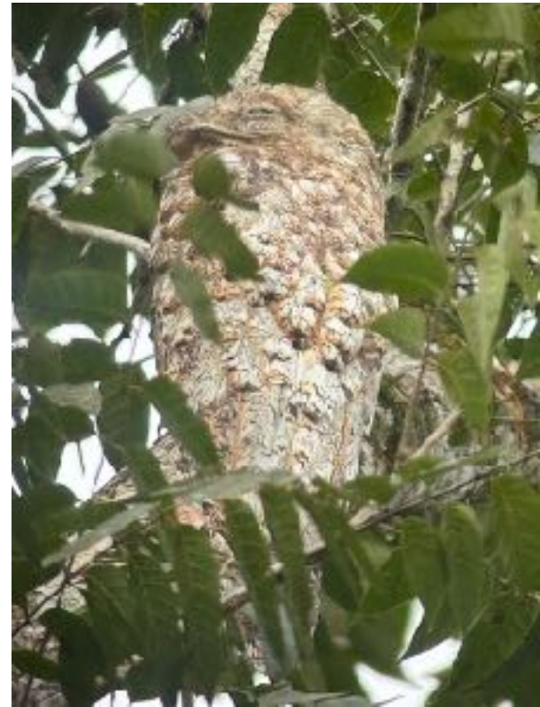
Great Potoo, resembling a tree stump. Carol's favorite tropical bird.

October 2: Plantation Road, Old Gamboa Resort Sloth/Butterfly/Frog Conservation Center, Transfer to Canopy Lodge, Lodge Grounds, including night walk.