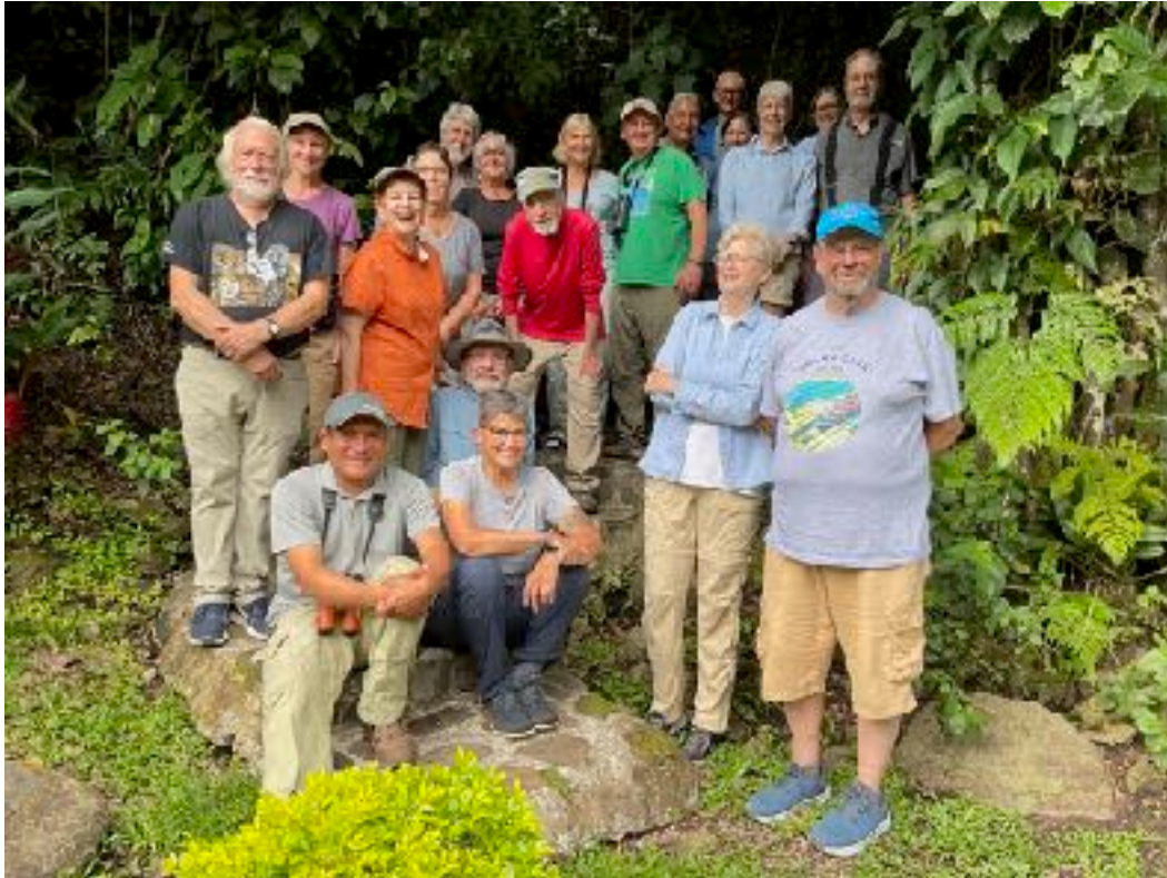
Workshop Participants and Guest Scientists

Sponsored by the Canopy Family and Naturalist Journeys