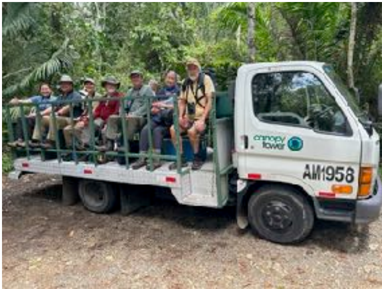
Typical Transport

October 1: Canopy Tower, Pipeline Road, Panama Canal Miraflores Locks, Night Walk on Plantation Road.