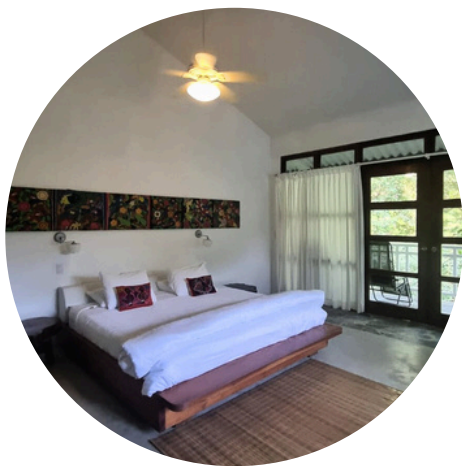
Double rooms with 1 King Size Bed + balcony