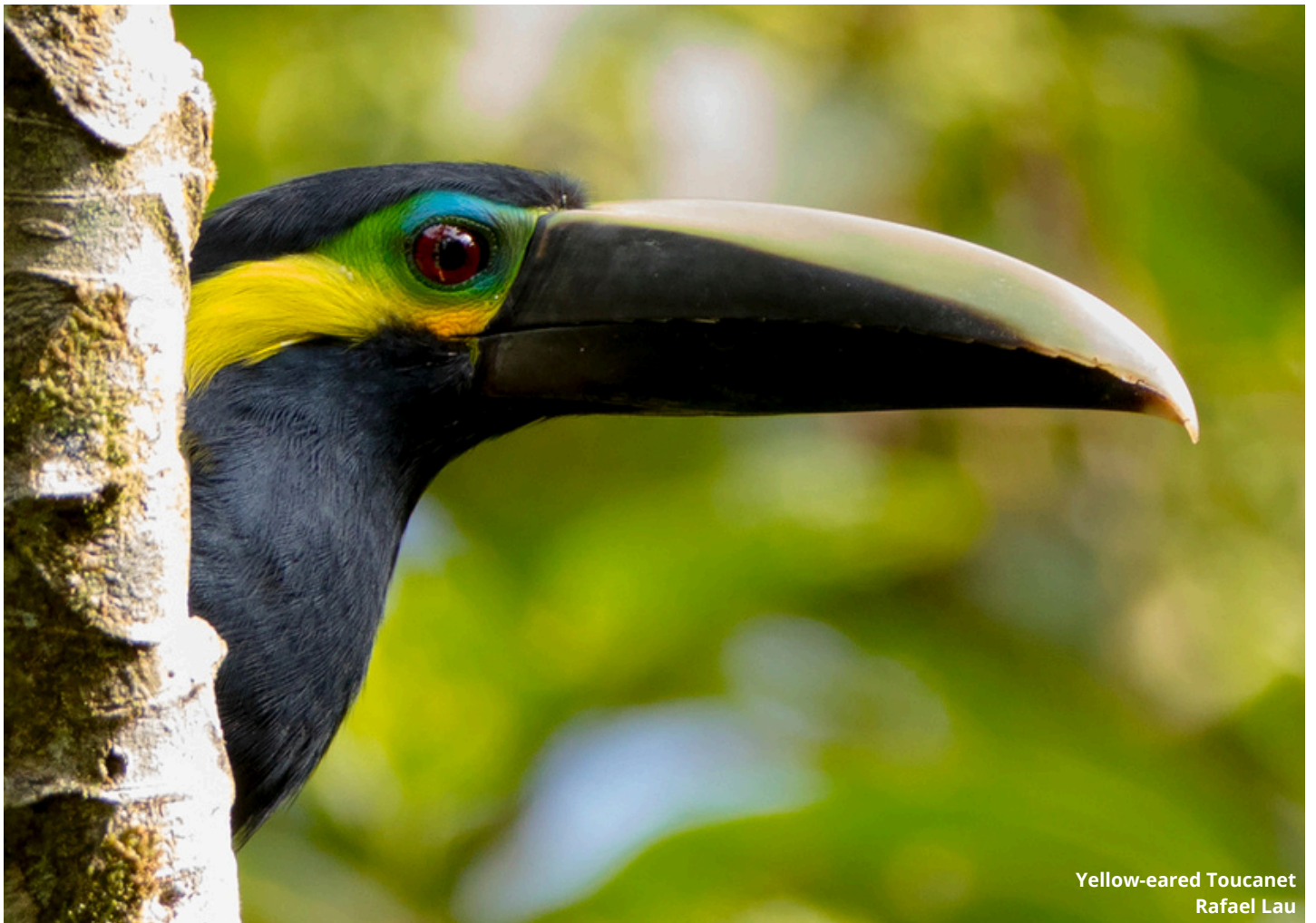
Yellow-eared Toucanet Rafael Lau

not until we check the feeders one last time! Dinner at CANOPY LODGE.