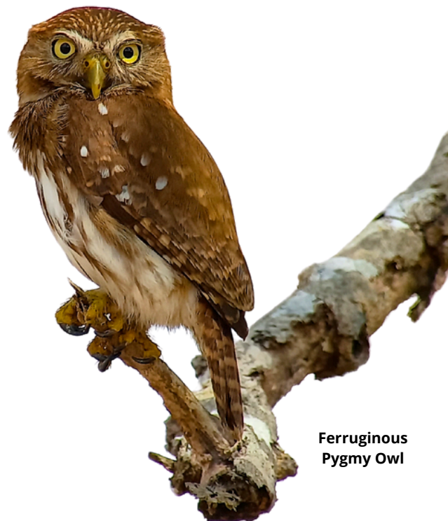
Ferruginous Pygmy Owl

After breakfast we are off for a full day of Panama bird watching in the Pacific dry forest, with its unique cast of birds! Among the species we will be seeking out today are Yellow-headed Caracara, Roadside, Gray-lined, Zone-tailed, Savanna & Short-tailed Hawks, Peregrine & Aplomado (rare) Falcons, White-tailed Kite, and Ferruginous Pygmy-Owl. We will also search for Crested Bobwhite, Pale-eyed Pygmy-Tyrant, Golden-fronted Greenlet, Grassland Yellow-Finch, Rufous-browed Peppershrike, Brown-throated Parakeet, Blue Ground Dove, Red-breasted Meadowlark, Fork-tailed Flycatcher, and Crested Oropendola. We stop at a spot where we sometimes find Common Potoo.