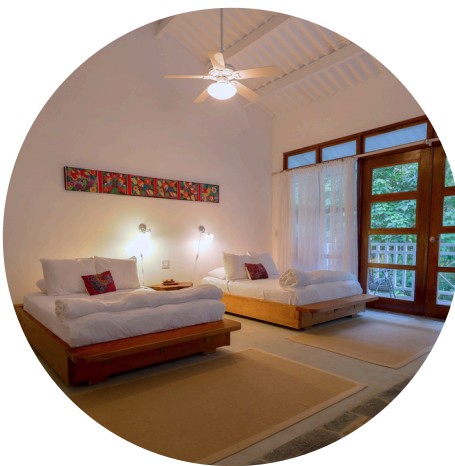
Double rooms with 2 Double size beds + balcony