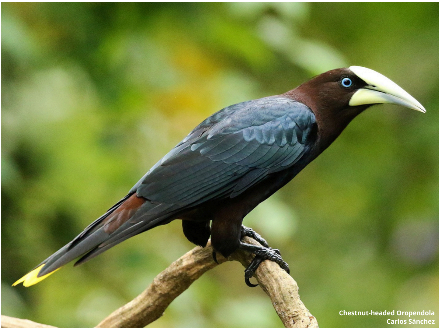
Chestnut-headed Oropendola Carlos Sánchez

Please note that the itinerary is flexible, and may change without prior notice due to weather, alterations in habitat or other conditions.