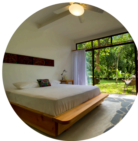
Single rooms with 1 Double Size Bed + picture window

All rooms have a private bathroom with hot water, a ceiling fan, a desk, reading lamps, a towel warmer and storage space