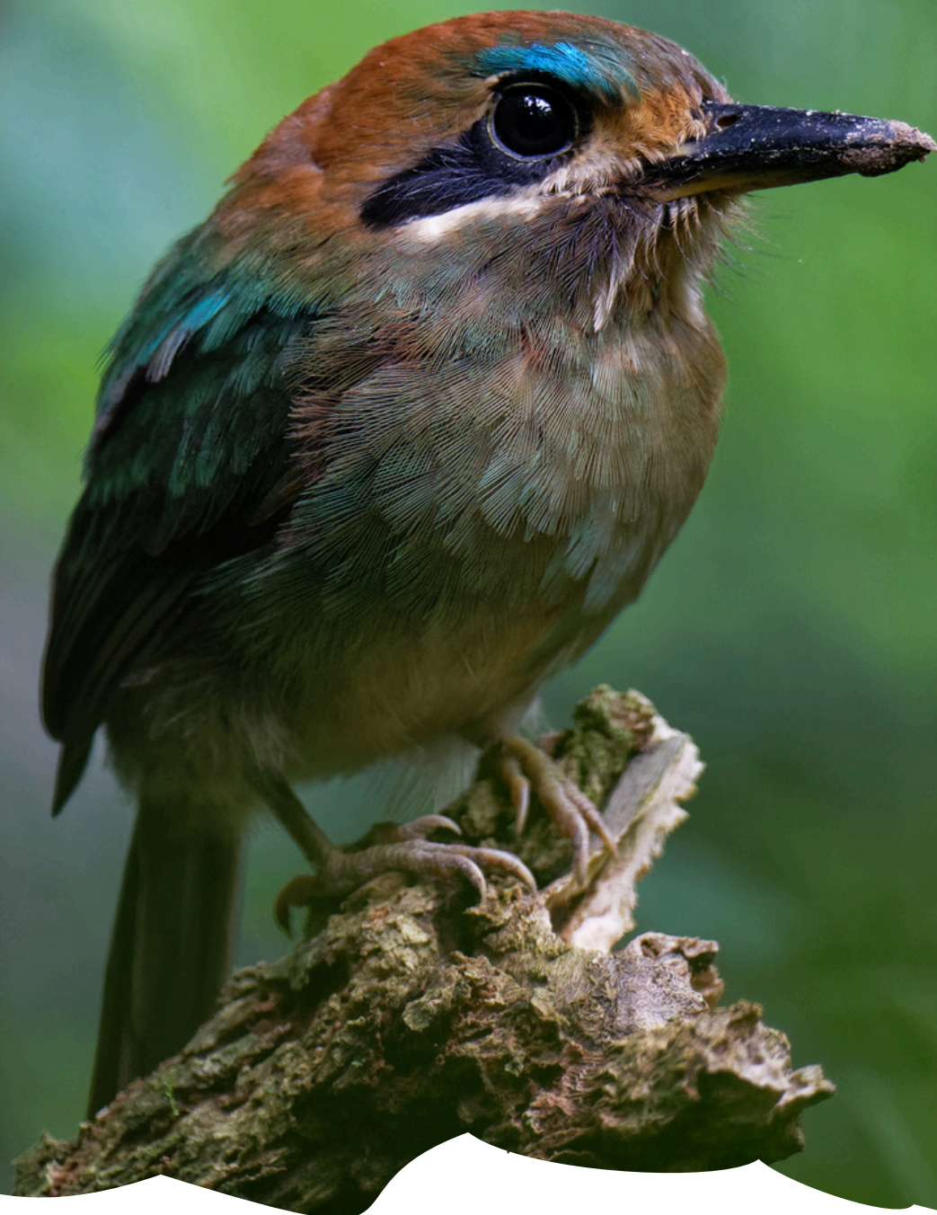
Tody Motmot Uwe Speck

This all-inclusive tour explores the foothills and cloud forests of El Valle de Anton — the home of motmots, tanagers, hummingbirds, antpittas and the mythical Rufous-vented Ground-Cuckoo!