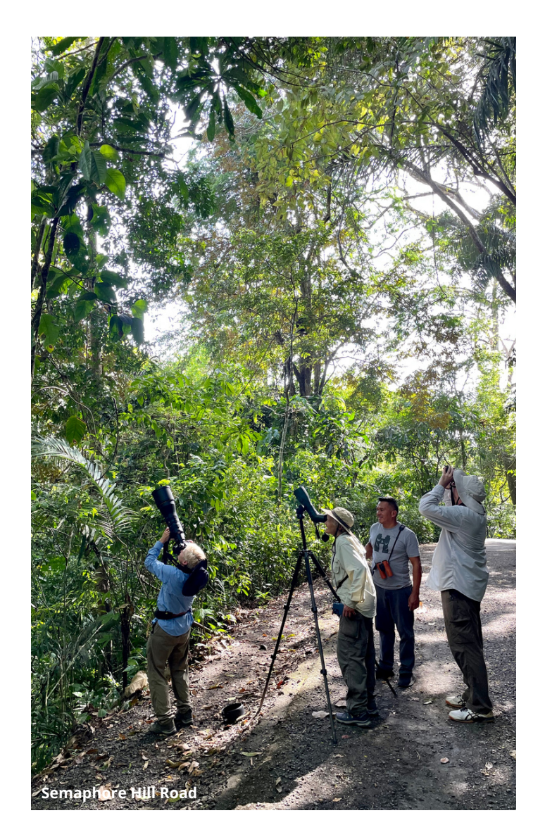
CANOPY TOWER & SEMAPHORE HILL ROAD

canopy. Many birds in the rainforest, including toucans, parrots, tanagers of various species, hawks, and dozens of others, as well as monkeys, two species of sloth, and other mammals commonly seen. From are vantage point you can also see ships transiting the Panama Canal, the majestic Centennial Bridge, and miles of rainforest! You may also want to watch the hummingbird feeders at the base of the Tower for Long-billed White-necked Hermit, Jacobin, Violet-bellied Blue-chested & Humminabirds and White-vented Plumeleteer. Occasionally, a Snowybellied Hummingbird is spotted! After all this Panama birding, dinner will be served at the CANOPY TOWER.