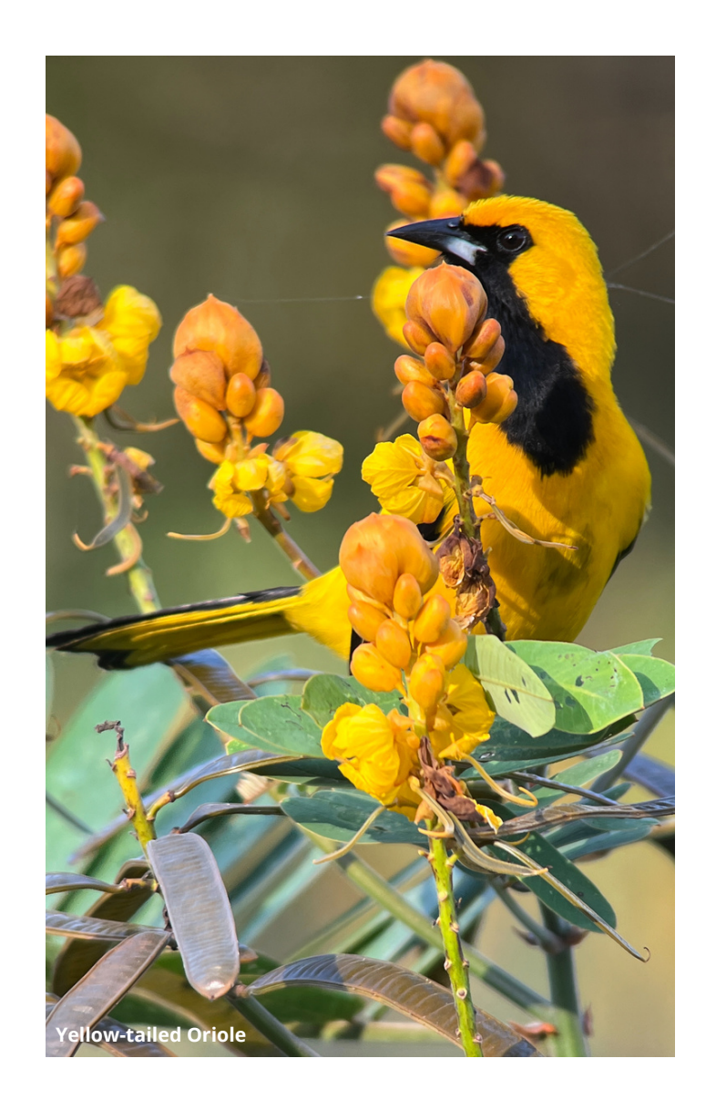
DAY 4 PLANTATION TRAIL (5 MIN. FROM CANOPY TOWER)

Summit Gardens is a center for recreation. education and conservation, dedicated to reflecting and enhancing Panama's tropical and cultural diversity. The botanical gardens are great for migratory warblers and other forest-edge including colony species, a Oropendolas, Chestnut-headed Yellow-margined Flycatcher, Laughing Falcon, Gray-lined, Crane Great Black Hawks, Collared Forest-Falcon. Tropical Pewee, Masked Tityra, Golden-fronted & Scrub Greenlets. Yellow-crowned Tyrannulet, Yellow-rumped Cacique, Giant, Shiny & Bronzed Cowbirds, and Blue Cotinga. This park is the best place to find Streak-headed Woodcreeper, a difficult species to get elsewhere on this tour. The Harpy Eagle is Panama's national bird, and this park has an exhibit, including a life-size nest and interpretive panels, tracing the importance of the Harpy in Panamanian history and culture dating back to Pre-Columbian times. Dinner at CANOPY TOWER.